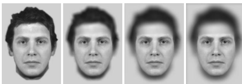
Figure 1. Blurring of external features illustrated on a synthesised face from EvoFIT. The level of Gaussian blur shown (from left to right) is zero (no blur), 4 cycles per f/w (low), 6 cycles per f/w (medium) and 8 cycles per f/w (high). In Experiment 1, participant-constructors constructed a single composite by selecting from arrays of 18 such faces with external features degraded at the same level. See Figure 2 for example composites constructed in this experiment.

Gaussian blur is an image filtering technique often measured in cycles per face-width (f/w) (e.g. Costen, Parker, & Craw, 1996; Thomas & Jordan, 2002), but it can also be measured as a radius (pixels) (e.g. Jeong, Kim, & Lee, 2010). In both cases, higher values degrade an image to a greater extent. In Frowd, Pitchford, et al. (2010), external features were blurred at 8 cycles per f/w. Here, this 'high' blur was compared against two evenly spaced intermediate levels, 'medium' (6 cycles per f/w) and 'low' (4 cycles per f/w); a fourth condition was included with blurring disabled throughout face construction. In Stage 1, below, participant-constructors were randomly assigned to one of four levels of external-features blur (none, low, medium or high). Each person evolved a single composite image from memory using EvoFIT with face arrays set to present external features at this level of blur. Figure 1 illustrates the four levels used.