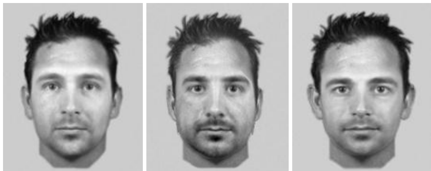
Figure 4. Example composites of UK footballer, Frank Lampard, produced from constructors in Experiment 3 in conditions of (left to right) normal-blur, extended-blur and internals-only. These and other images produced in each condition (along with four non-target composites) were shown to evaluators to name—the resulting mean naming scores (adjusted for target familiarity) can be seen in Table 3. Note that, unlike Experiment 2, constructors here were allowed to select hair; when doing so for this target, each person independently selected the same style (the constructor using extended-blur then lightened it).

participant-evaluators. This reduces evaluators' ability to make an identification by process of elimination from the somewhat limited pool of international footballers: they know that some composites are not of footballers and so have to make a more active identification. These filler items were randomly generated from EvoFIT; they were faces selected (by the first author) from the first generation to appear visually similar to the footballer targets. All were given a short, contemporary hairstyle typically worn by these athletes. Composites and target photographs were printed as previously.