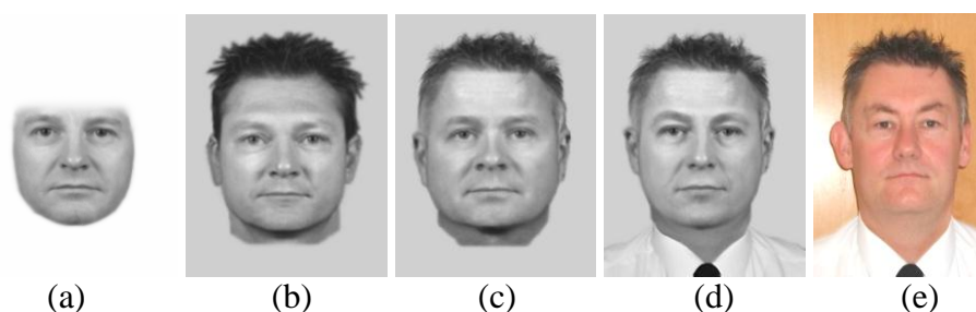
Figure 3. Images produced by individual constructors in Experiment 2 and presented to evaluators to name. They were produced using (a) no external features, or with external features containing (b) similar hair, (c) exact hair or (d) exact hair and shoulders. Image (e) is the target photograph used to construct these composites; its hair, and hair and shoulders, were extracted and presented to constructors for face synthesis in conditions (c) and (d), respectively. Unlike Experiment 1, no blurring was applied to the exterior facial parts during construction.

Materials, Design and Procedure. Two groups of evaluators were again recruited to name printed composites seen in one of two image preparations. For both groups, evaluators were tested individually. The first group saw 30 complete composites produced under conditions in which external features were visible: similar hair, exact hair, and exact hair and shoulders. The second group saw these same images shown as internal features along with the 10 composites constructed in the internals-only condition, images that themselves contained just internal features. Afterwards, target photographs were presented for naming. Printing of composites and targets, their dimensions, and the procedure used to name the composites, were the same as in Experiment 1. Example images constructed in Stage 1 are presented in Figure 3.