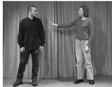
B-TC combination: same agent, same tense, different theme