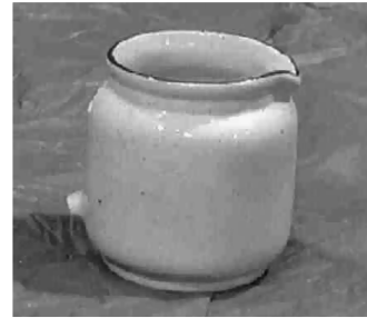
Same combination: same object, different form