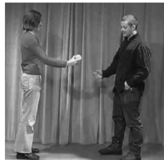
Filler combination: different agent, same tense, different theme