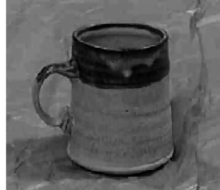
Same type combination: different object, same form