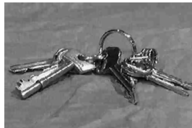
Different combination: different object, different form