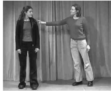
B-AC combination: same agent, different tense, same theme