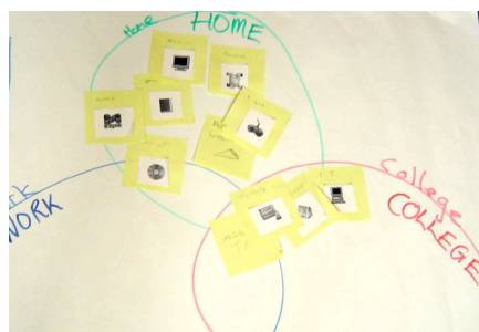
Figure 3. Stephen's Icon Map. Home : Surfing net for information / 'personal research'; downloading tunes; burning CDs; playing X Box; using website to 'share' tunes etc via the 'Kazaa' website; reading fiction. College/Home Overlap : Using IT; reading newspaper; reading handouts; using mobile phone for texting.

Two students' icon maps will be explored as examples of this data. First, we take Stephen who is an Intermediate 1 catering student.