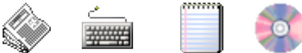
Figure 2. Examples of icons used.

identification across context. For this method, a set of 40 ‘icons’ were presented to students. These, in semiotic terms are in fact symbols that could be interpreted differently by each respondent to denote the sorts of literacy practices and events they wanted to discuss (see figure 2). Piloting allowed us to refine the icon set to reflect the sorts of activities students found relevant. After piloting, we realized the method allowed respondents to fruitfully explore how these processes relate through the lens of literacy, perhaps in part, because the respondents had already become quite ‘literacy-aware’ through participation in earlier fieldwork.