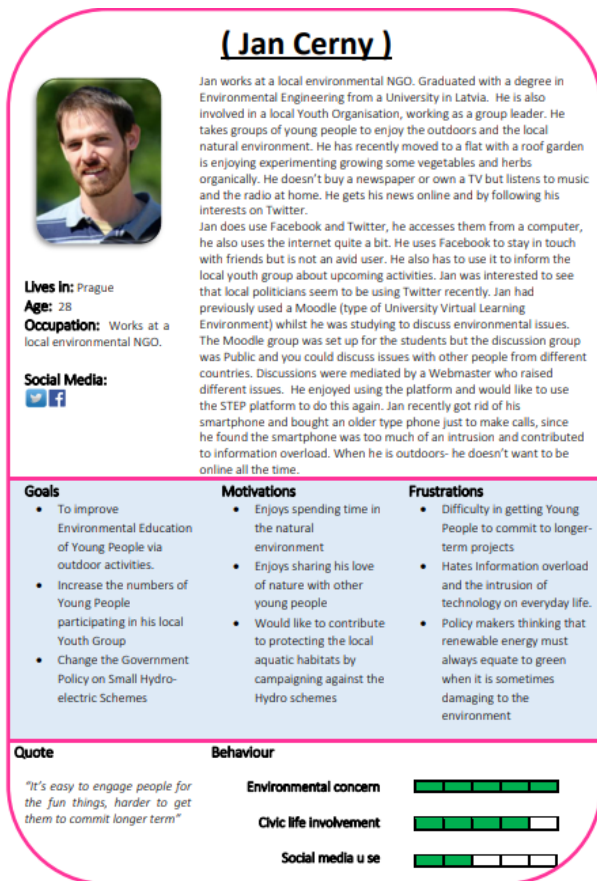
Figure 2: Example persona from the STEP project